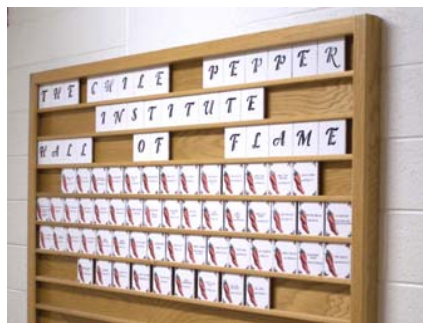
exhibit with a donation that in turn provides them with their own

Chile Pepper Institute members from around the world are helping to provide financial assistance for 'The Story of Chiles' exhibit at the New Mexico Farm & Ranch Heritage Museum and the Center for Chile Education chile exhibits. Companies and individuals may contribute to the